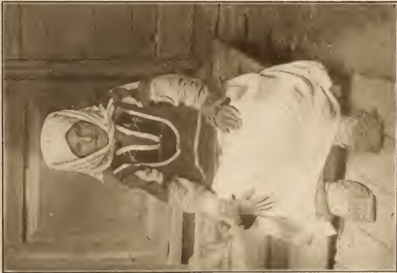
THE ONE WHO STAYED AT HOME

The horizon of her life is indicated by her impassive features.